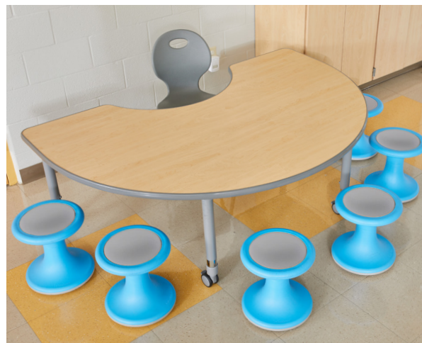
Mobile Group Table · Premium Wobble Chairs