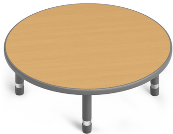
Low Round Floor Table - Modern Maple LC680