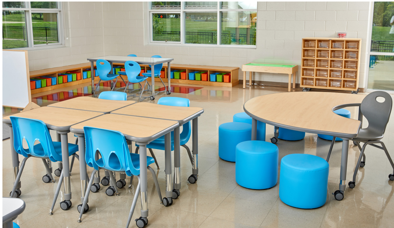
Mobile Student Desks • Mobile Group Table