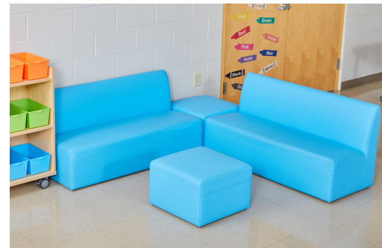
Lounge & Learn Couches & Ottomans