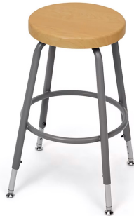
Height-Adjustable Stool - Modern Maple LC637