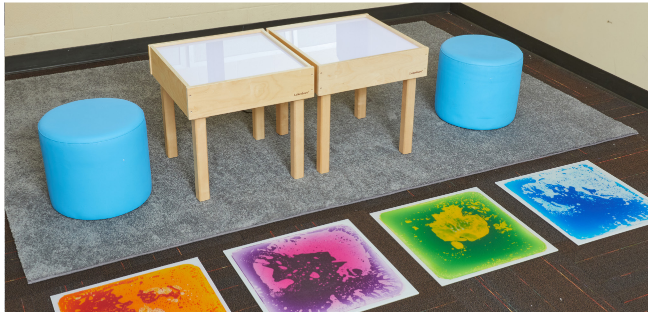
Color-Changing Light Tables · Liquid Floor Tiles