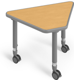
Mobile Wedge Student Desk - Modern Maple LC787