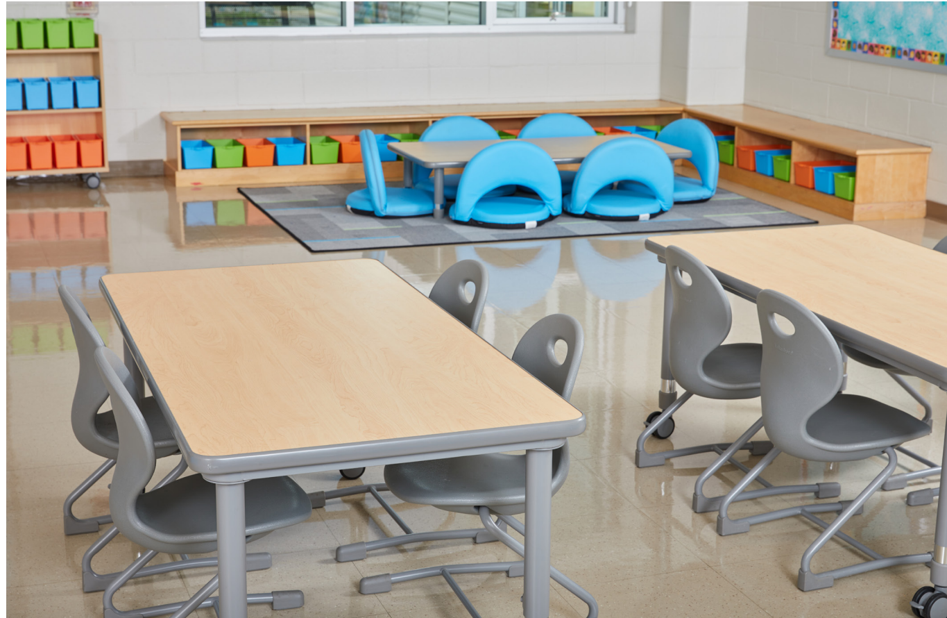
Ergo Bounce Cantilever Chairs · Mobile Rectangular Tables · Premium Floor Seats · Rectangular Floor Table

Kathy Rodriguez, Principal, Charter Oak Primary School