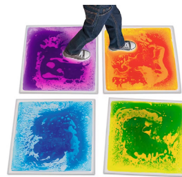
Liquid Floor Tiles SE401