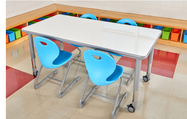
Write & Wipe Mobile Rectangular Table