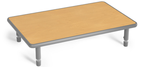
Rectangular Floor Tables - Modern Maple LC756 • 30" x 48" LC758 • 30" x 60"