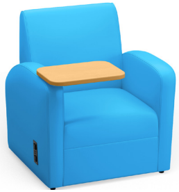
Comfy Chair with Desk & Power LK102