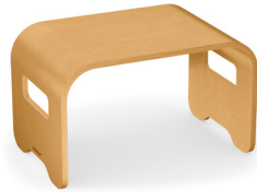
Student Lap Desk LC153