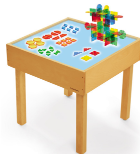
Space-Saver Color-Changing Light Table LL526