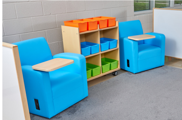
Comfy Chairs with Desks & Power