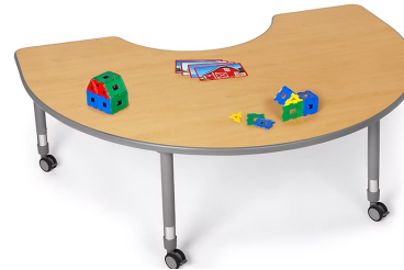
Mobile Group Table - Modern Maple LK226 • 72" x 48"