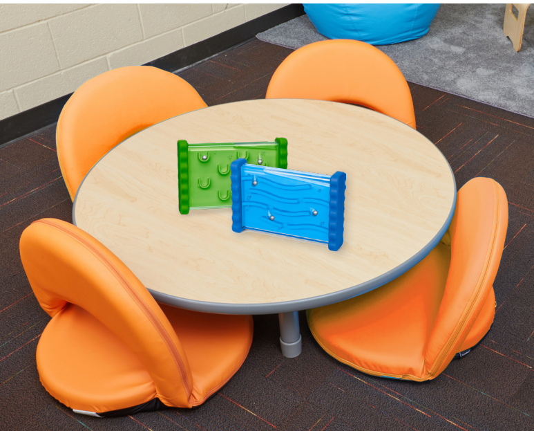
Premium Floor Seats · Low Round Floor Table · Tilt & Turn Liquid Sensory Windows

Jaime Peterson, Principal, Kellar Primary School