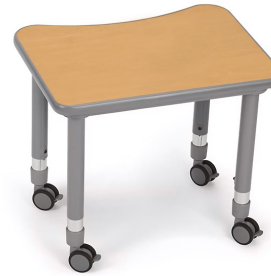
Mobile Student Desk - Modern Maple LK788