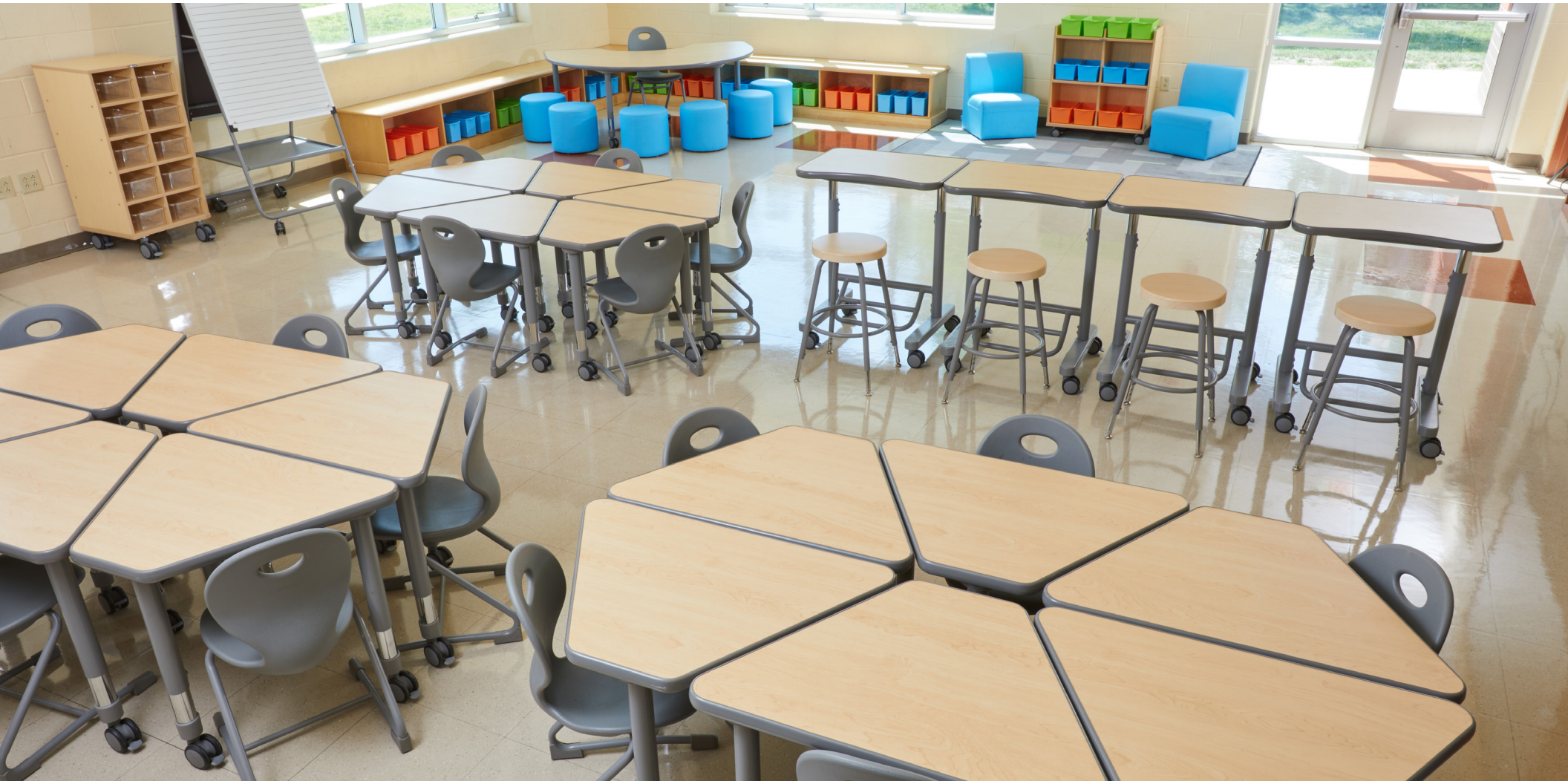
Mobile Wedge Student Desks • Mobile Standing Desks • Height-Adjustable Stools

For example, Lakeshore delivered smooth-rolling Mobile Wedge Student Desks that easily configure to accommodate groups of 2-6 students or more. (Plus, having individual mobile desks that adjust in height from 23" to 34" allows students of all sizes to work independently, one-on-one, or as a team for study, problem solving, and connection.) To foster an even greater degree of student choice, Peoria was supplied with height-adjustable Mobile Standing Desks and Height-Adjustable Stools . Options like these support even more configurability in the classroom and provide students with the focus they need in order to learn.