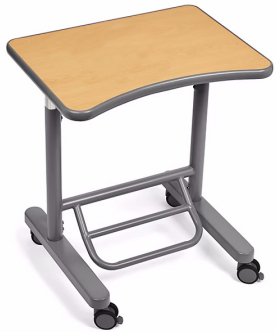
Mobile Standing Desk - Modern Maple LK571