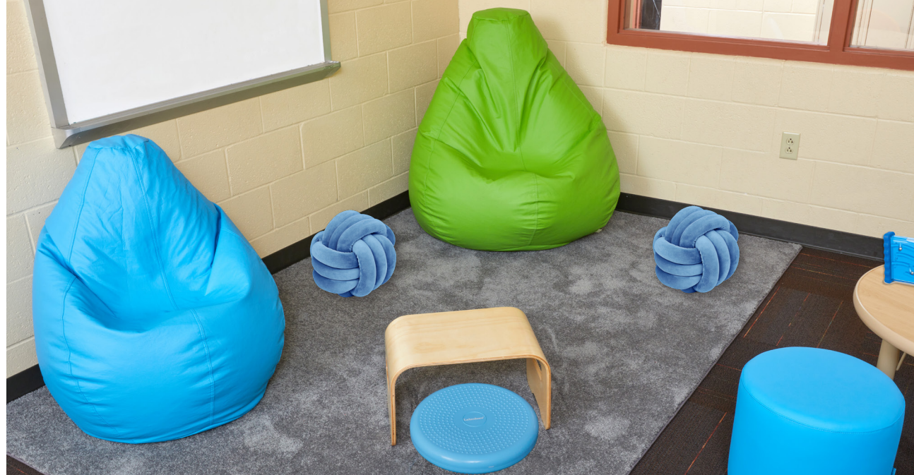
Teardrop Beanbag Seats · Wobble Cushion · Student Lap Desk · Calming Cuddle Balls

To provide students with hands-on sensory experiences that restore focus when overwhelmed by uncomfortable emotions, Lakeshore offered Color-Changing Light Tables , Liquid Floor Tiles , Tilt & Turn Liquid Sensory Windows , and Calming Cuddle Balls designed to soothe the senses.