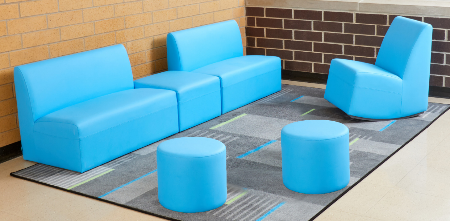
Lounge & Learn Couches & Ottoman • Comfy Soft Rocker • Comfy Stools